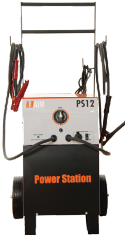
PS12 12 VOLT