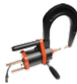
Standard 10" Arm