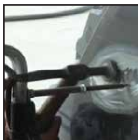
Hold Repair Area to Hammer