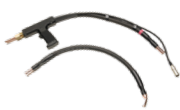
SA-116 Single Side Welding Package