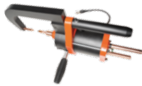
Standard 3" Arm on EZ Change Handle