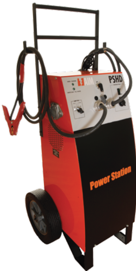
PSHD 12 VOLT