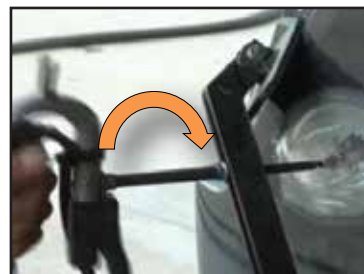
TWIST gun to quickly remove