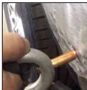
Shrink Metal with Shrink Tip