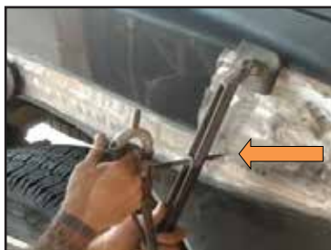
PULL metal with pry bar