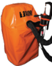
SA-122 HWS Dust Cover