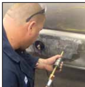
Use Optional Slide Hammer