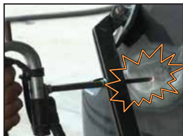
STICK electrode to repair area