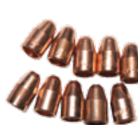
Assortment of Weld Tips